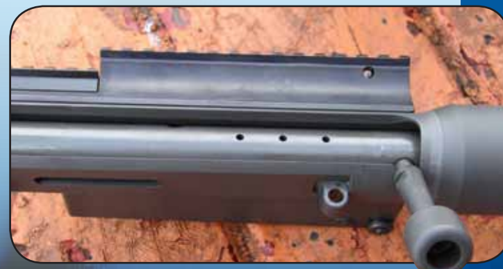
On the SHTF-50, everything is big and built for use, from the hefty bolt to the long bolt handle for better leverage in working the action.