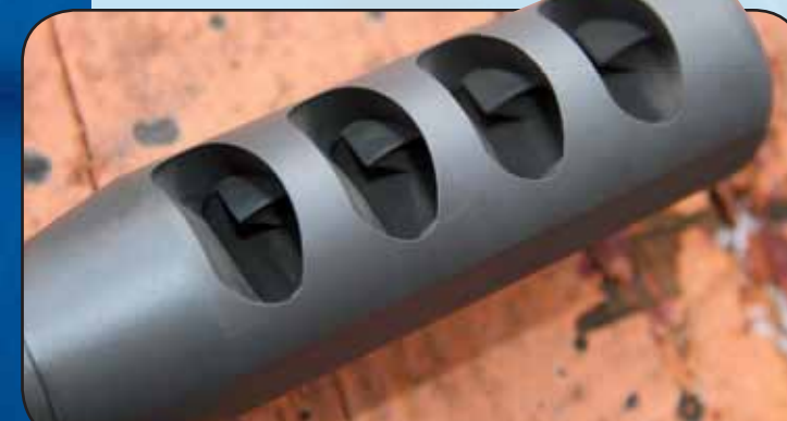
You can see the brake and the internal gas scavengers.