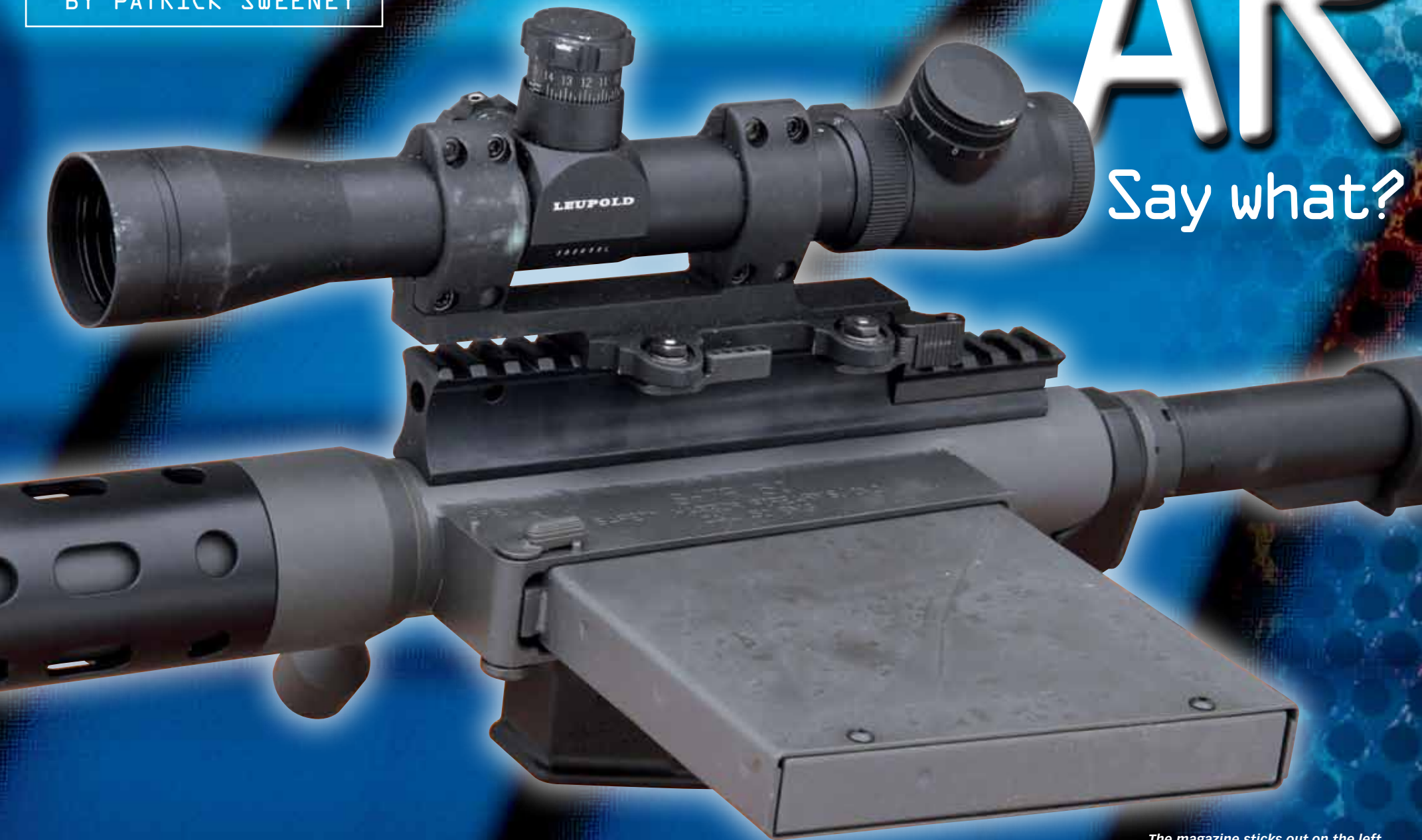
The magazine sticks out on the left side of the Safety Harbor Firearms' SHTF-50 upper. And while it feeds fine, it can feel in the way.