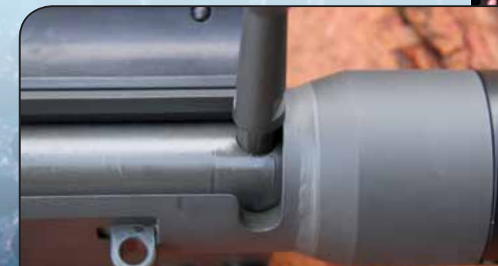
The bolt handle rides down into this slot, acting as a safety lug for the big .50 boomer.