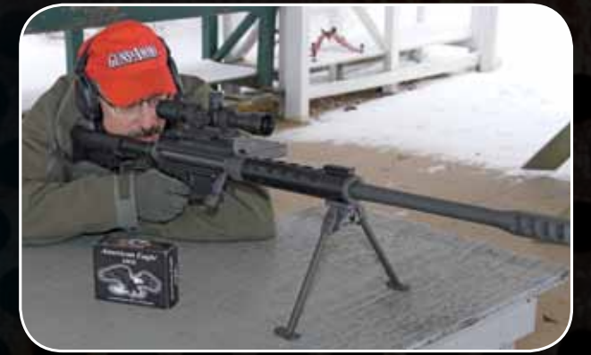
From the bench, any .50 is going to be a handful. When the full-up weight is just under 20 pounds, things can get interesting.

I t is in the nature of compromises that you have to give up something in order to get something. No matter how you try, or how good an attorney you hire, you simply cannot get around the Thermodynamic Laws. To launch really big bullets at impressive velocities takes a honkin' big gun, with mass and length, and cost.