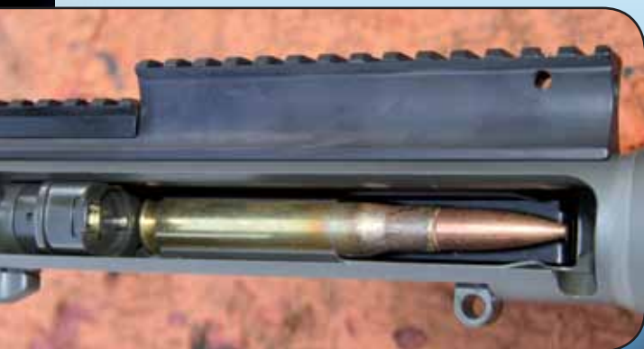
The magazine is stoutly made and feeds each round easily.

And let me be clear here: I'm not picking on Safety Harbor